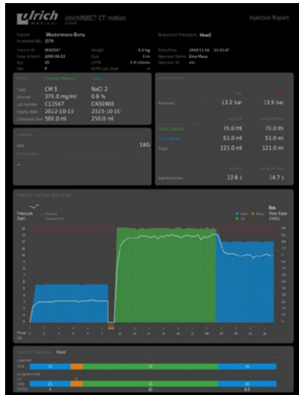
CM dose report as DICOM SC image